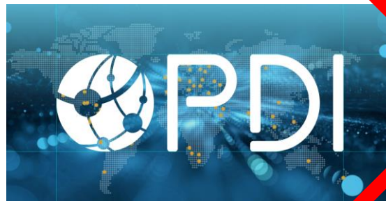
Don't place on top of images