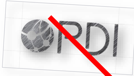
Don't rotate or tilt